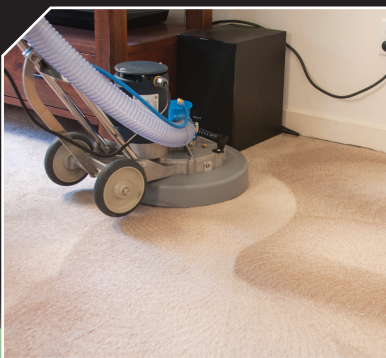
Use with the HOSS 700 Rotary Tool: 67-025