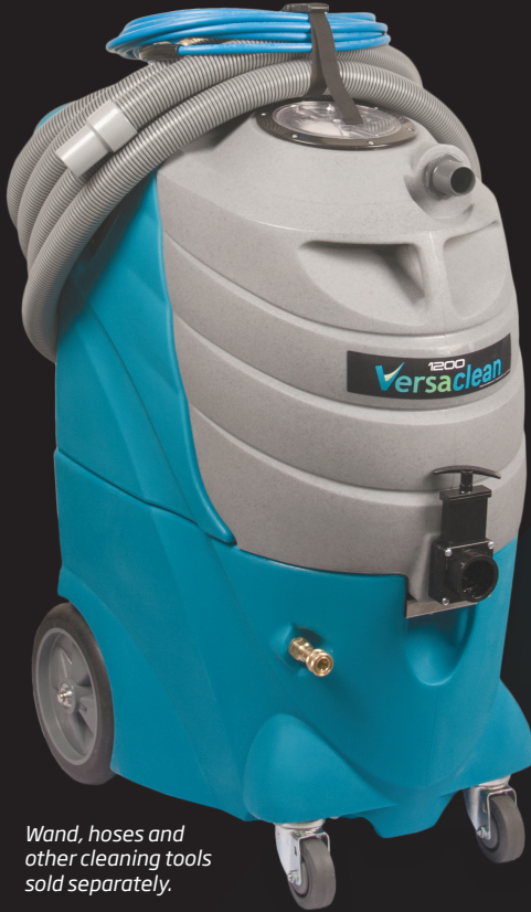
Wand, hoses and other cleaning tools sold separately.

Tired of those unreliable, hard to transport and poor-performing "box extractors"? Move up to the high performance, superior quality and mobility of the Versaclean Portable Extractor.